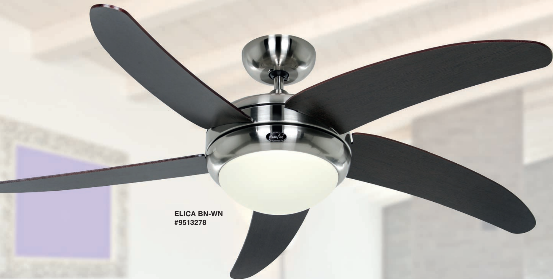
ELICA BN-WN #9513278