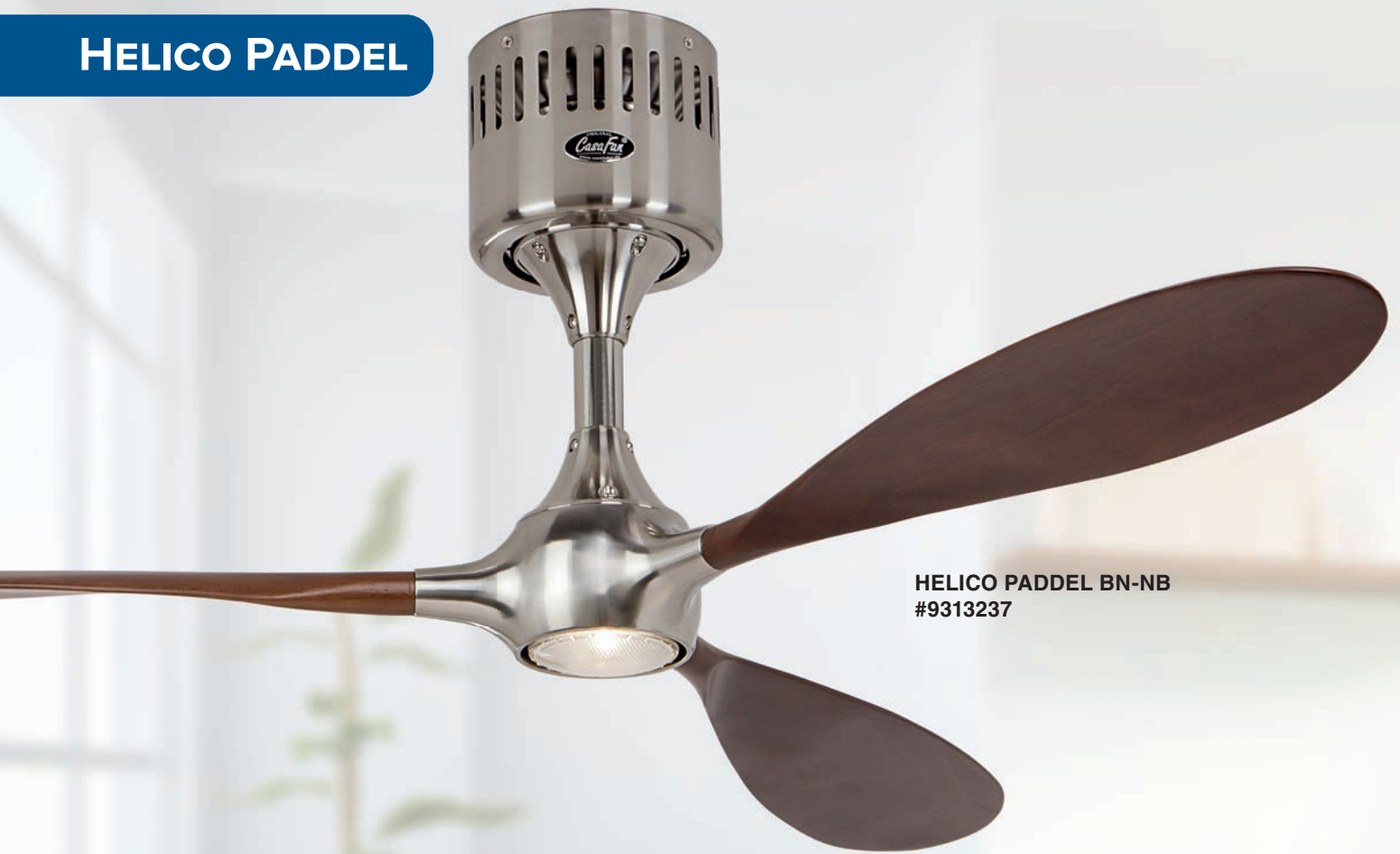
HELICO PADDEL BN-NB #9313237